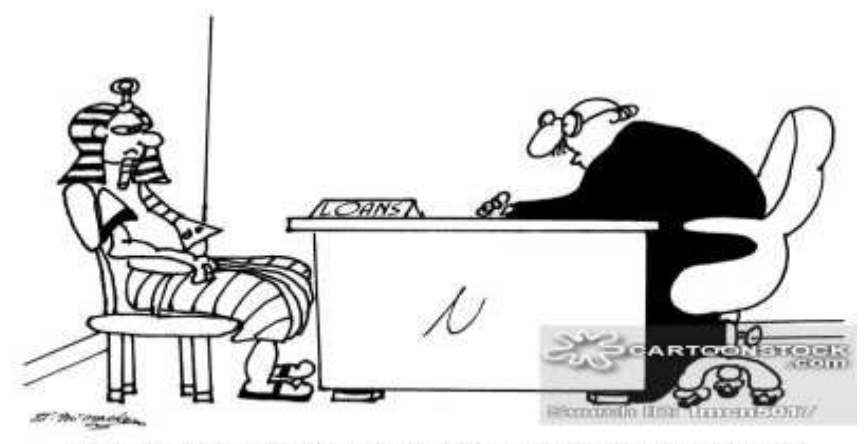
"SO YOU NEEP MONEY FOR MUNICIPAL BRIBES TO GET YOUR PYRAMIPS REZONEP FOR CEMETERY USE."

There is a proposed zoning change on the corner of Grayson Highway and Hillside right next to Starling Elementary School. The zoning change is a change from R 100 or C2 to RM 24 apartments. As noted on the sign there will be a meeting at 7:00 PM, Monday, April 9<sup>th</sup> at Gwinnett County Justice and Administration Center Auditorium 75 Langley Drive, Lawrenceville, GA. Considering the overcrowdedness of the schools and the road, we need to show up in force to voice our concern and disapproval of this change.