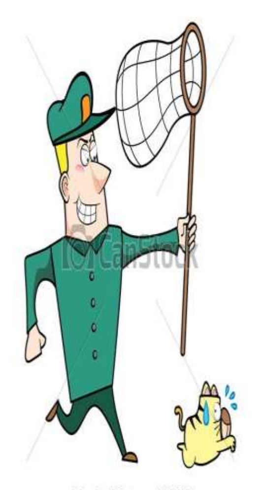
© Can Stock Photo - csp13153142