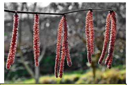
Spring is definitely in the air (including pollen),