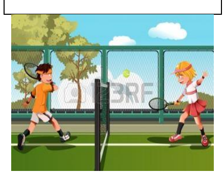
Reminder: the online reservation system for the tennis courts is the only way to reserve a court. Sign up here: <a href="https://wellingtonwalk.skedd">https://wellingtonwalk.skedd</a> a.com